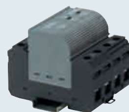
FLT-CP-1S-350 ... for 3-wire networks Order No.: 28 59 73 8