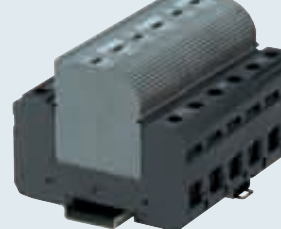
FLT-CP-3C-350 ... for 4-wire networks Order No.: 28 59 72 5