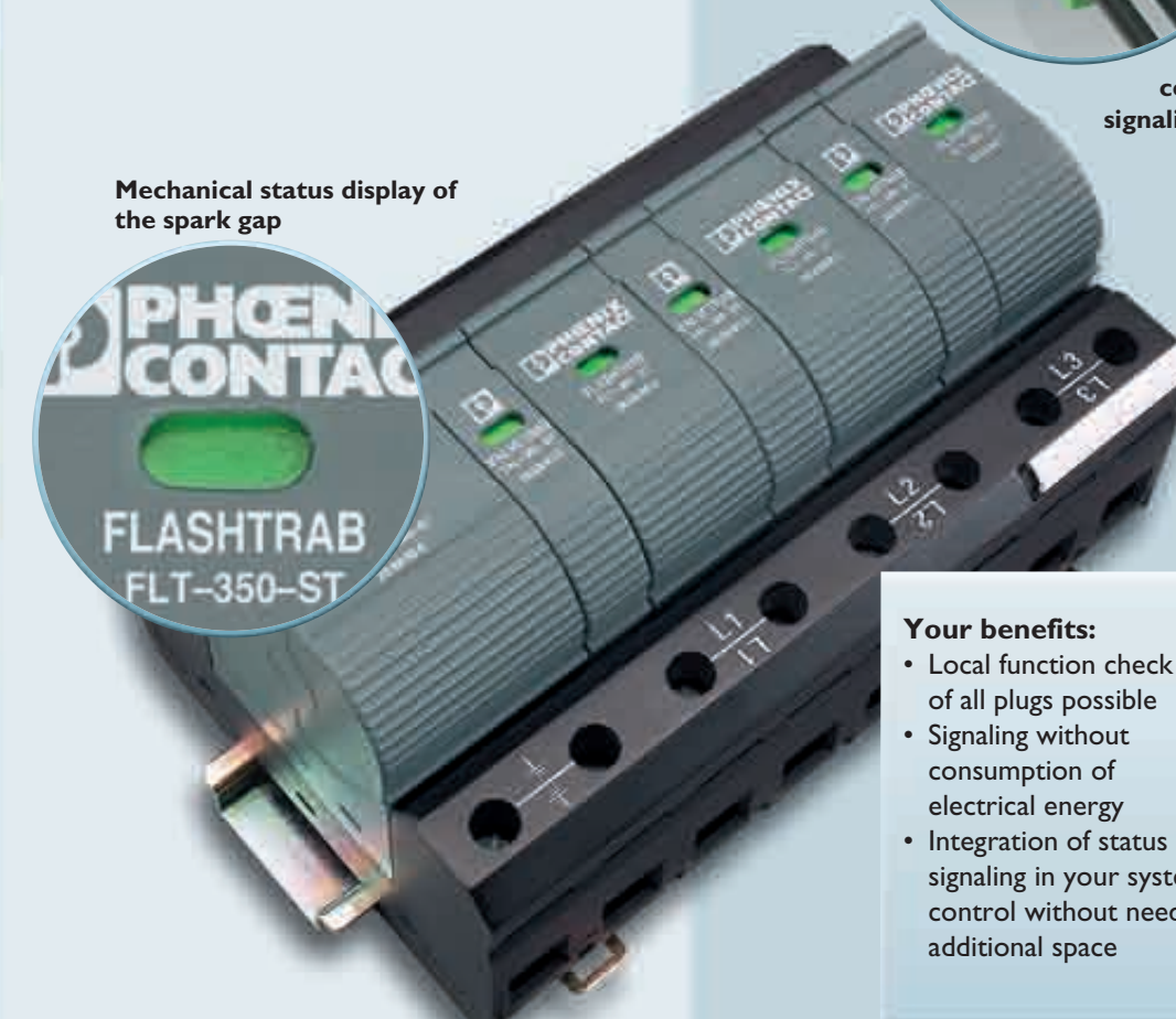
Mechanical status display of the spark gap