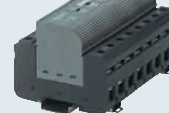
FLT-CP-3S-350 ... for 5-wire networks Order No.: 28 59 71 2